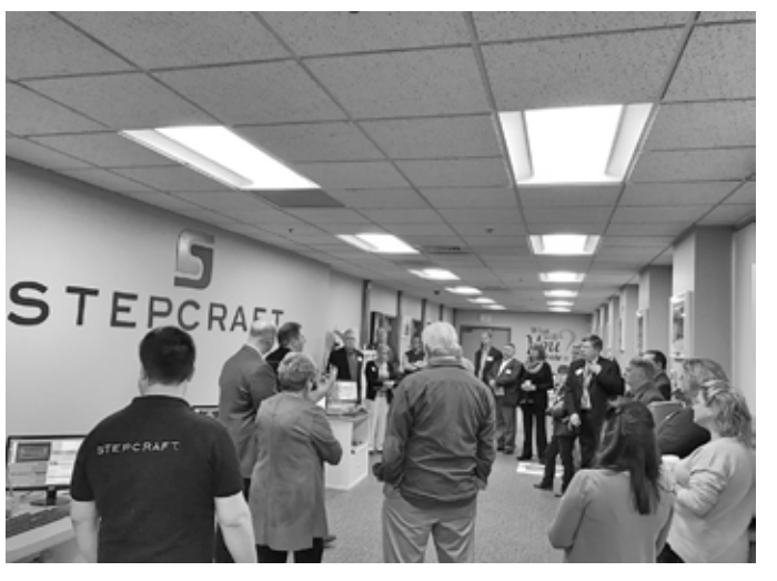
New Chamber member, Stepcraft of Torrington, hosted the Chamber's November meeting of the Manufacturers' Coalition. Members of the Coalition enjoyed a demonstration of Stepcraft's CNC System and a group voluntarily donated $250 each to purchase a machine to be used in a local school. For information on Stepcraft, visit their website at stepcraft.us.

Our Manufacturers' Coalition hosted 'Manufacture Your Future', an expo showcasing manufacturers in the region, in conjunction with Oliver Wolcott Technical School's annual Open House for 8th graders and their parents. The event was well attended and the manufacturers had the chance to demonstrate their products and services to the community and educate the students and their parents about careers in manufacturing.