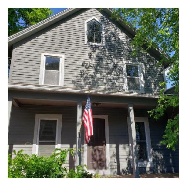
422 Main St. Airbnb

422 Main St. Airbnb is an Airbnb and short term rental located right on Main St. in downtown Torrington. It is a 3 unit house consisting of a large one bedroom, a studio apartment and an old Greenhouse converted into a one bedroom/event space. It also has a large garden that is perfect for small weddings and events.