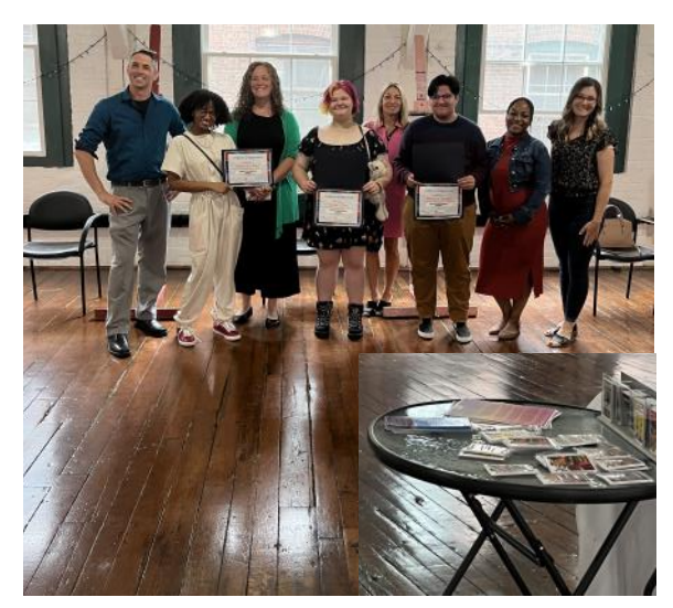
Group 1 - Zines for Teens

Congratulations to the Leadership Northwest Class of 2022 for making a difference in the areas of mental health and parkland revitalization!