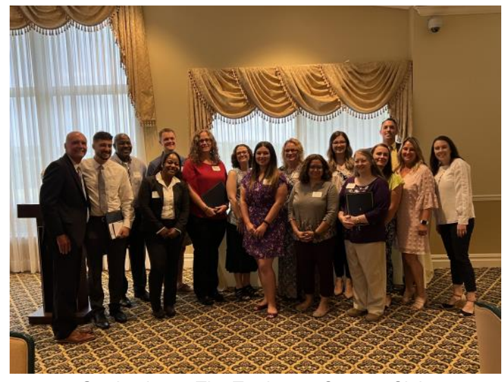
Graduation at The Torrington Country Club