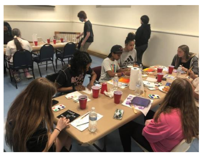
Group 4 - Paint 'n Pizza