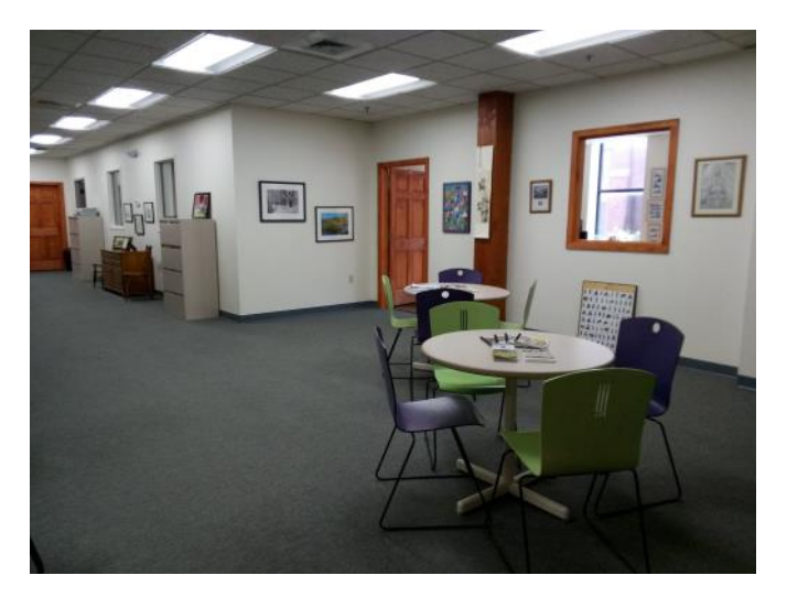
Reception Area - (Seats up to 8)

Member Room Rates: 8 am – 5 pm, $35 for the 1<sup>st</sup> hour, $20 per hour thereafter