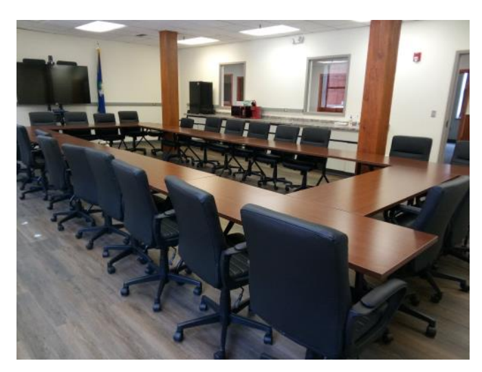
Conference Room - Conference Style (seats up to 28)