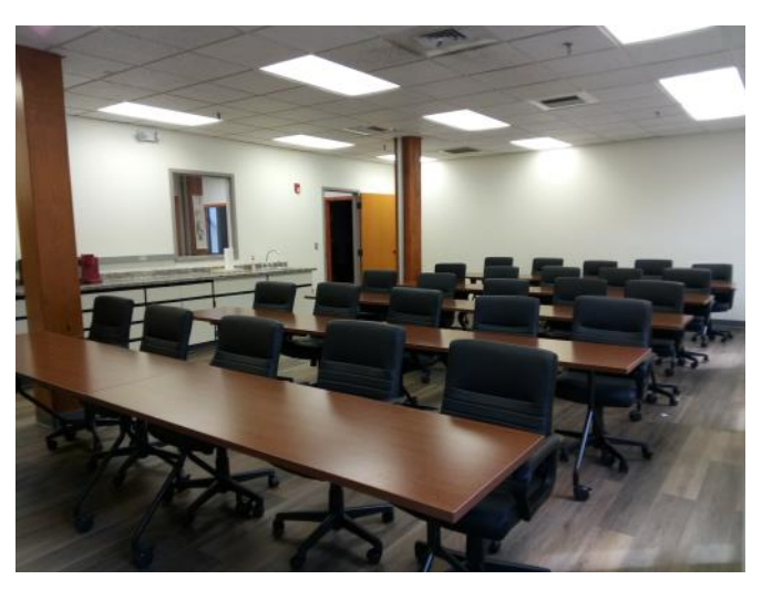
Conference Room - Classroom Setup (seats 20-25)