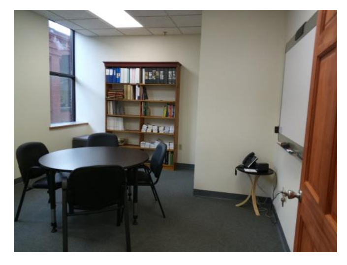
Library - (Seats up to 6)