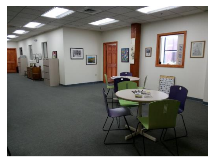
Reception Area - (Seats up to 8)

Member Room Rates: 8 am -5 pm, $35 for the 1<sup>st</sup> hour, $20 per hour thereafter