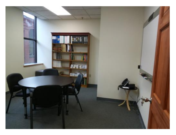
Library - (Seats up to 6)