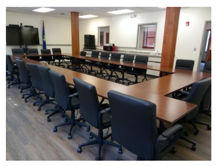
Conference Room - Conference Style (seats up to 28)