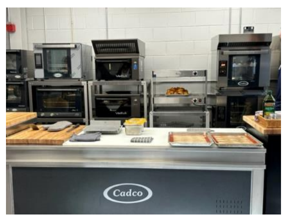
A Business with Breakfast was held on Tuesday August 22, 2023 at <u>Cadco, Ltd</u> in Winsted. The attendees received a tour of the commercial kitchen products manufacturing facility. The picture above is from their test kitchen.