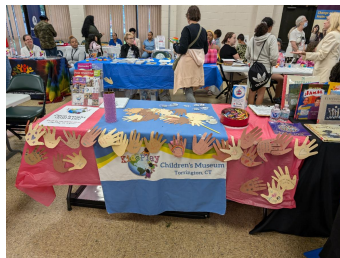
KidsPlay Children's Museum