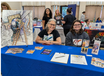
American Mural Project (AMP)