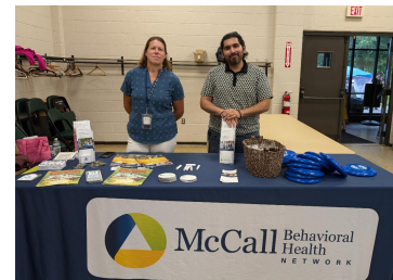
McCall Behavioral Health Network

A Community Event Embracing Diversity, Equity and Inclusion